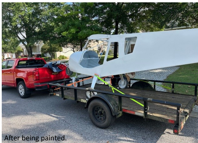
After being painted.