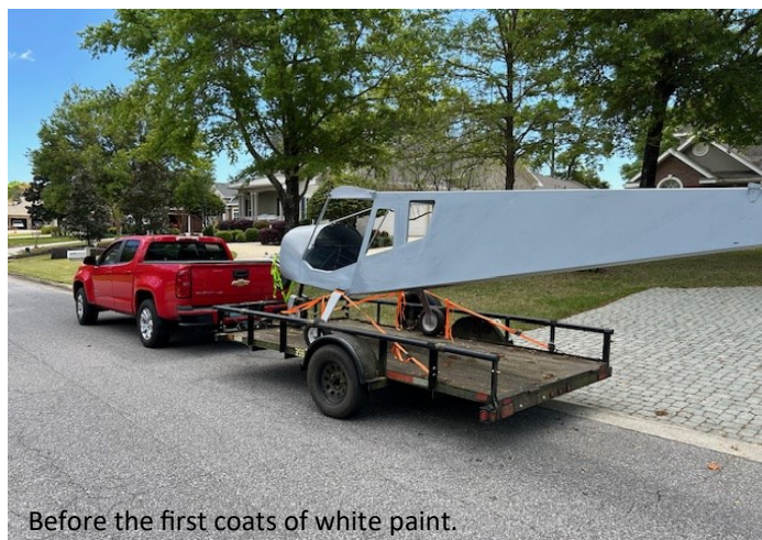
Before the first coats of white paint.

The first picture is of my project primed, prepped, and loaded up to go get painted. The right is after it came back from the painter. Next month I'll discuss dealing with the dreaded "Orange Peel" effect in paint. Ugh!