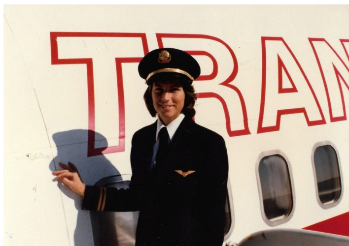
Trans World Airlines (TWA) was founded in 1930 and ceased operations in 2001, when it was absorbed into American Airlines.

She got hired by TWA as a flight engineer, flying on the Boeing 727. The airline had two other female pilots, and they got along well. However, they all got furloughed just a week short of being off probation: "You can't wait to get off probation, because your salary doubles — the first year at any airline is poverty," she says.